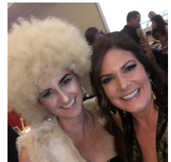
Studio 54 Event

kik and KSPTA contribute vital resources that allow our District to offer students outstanding and innovative learning opportunities well beyond standard public education.