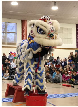
Innovative and Entertaining Events

New family socials and back-to-school coffees welcomed families to Kent and Bacich. Local businesses and volunteers supported these events and others, such as Walk to School days, the Crafts Fair, Chinese New Year Celebration, and Family Maker Night, so that all members of our community could enjoy time on campus and get to know other families.