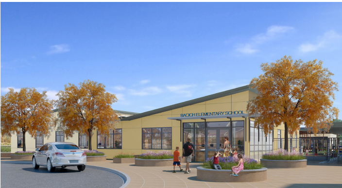
BACICH MAIN ENTRANCE