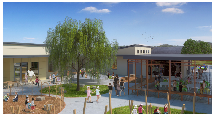
BACICH OUTDOOR LEARNING

At Bacich Elementary School, our architects designed six classrooms to replace the outdated round building and a new administration building at the front of campus for increased security and easier access for parents. The six new classrooms are paired into “learning suites” with breakout spaces to provide dynamic 21st century learning environments. The new building surrounds a creative play area that will provide a quiet and more nature-based alternative to the current playground and outdoor learning opportunities. A Maker Space will be housed in the new building to support STEAM projects at all grade levels.