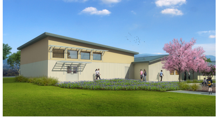
KENT MUSIC CLASSROOM

At Kent Middle School, construction on a variety of improvements and modernizations begins this summer. Kent’s administration office will be housed in a new prominent location that combines new and renovated space at the front of campus next to the Library to allow for better campus supervision and access. The current administrative offices will be renovated into new classrooms and offices.