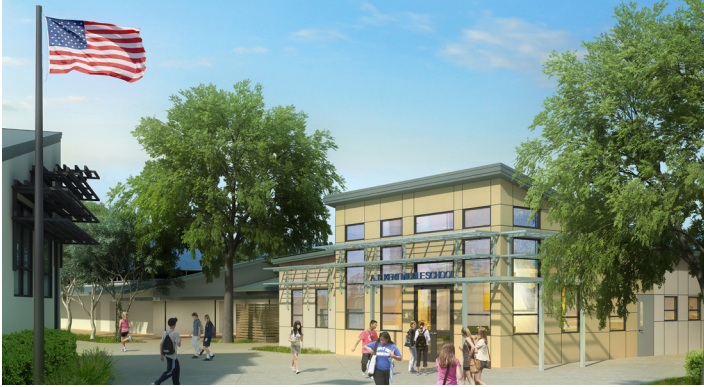
KENT MAIN ENTRANCE