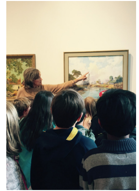
Quality Enrichments Funded

In addition, to raising crucial funds, kik hosts community events that bring families together. Our Family Fun Day and One Mile Fun Run in September had a fantastic turnout. Kentfield families love reconnecting with old friends and meeting new families at our selected grade-level-focused Heart of the Community events.